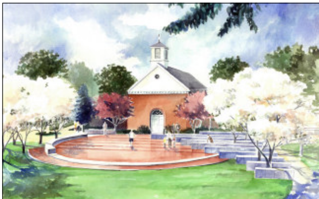
Artist rendering of NLC Workers Memorial

For years we have discussed honoring our members who died while on the job. We started out attempting to get plaques put on the wall in the foyer of our beloved union hall, and last year we had a candle light vigil but have not made it an annual event. All of that fizzled.