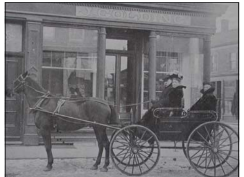
The beginnings of the ATU began with the first horse drawn, 'omnibus', 1832.

And now that gas prices have reached all time highs, Metro has finally become a recognized blessing.