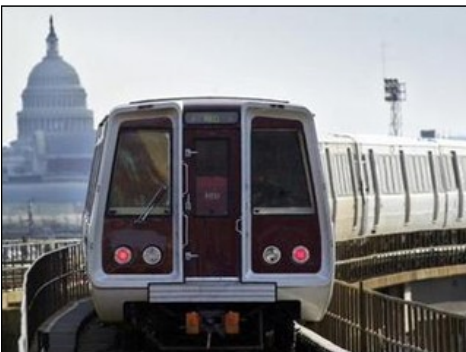
Local 689 has now expanded to trains and buses and continues to grow!

Last week, Local 689 members reviewed and discussed contract proposals from both WMATA and Local 689.